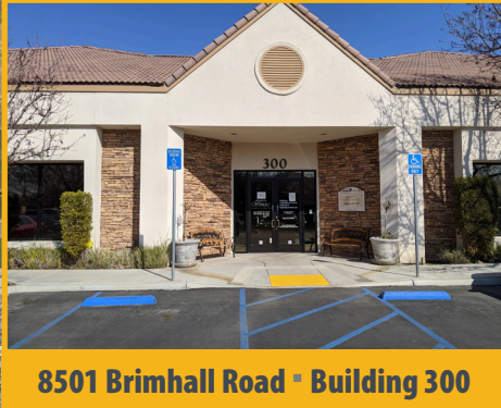
8501 Brimhall Road ■ Building 300